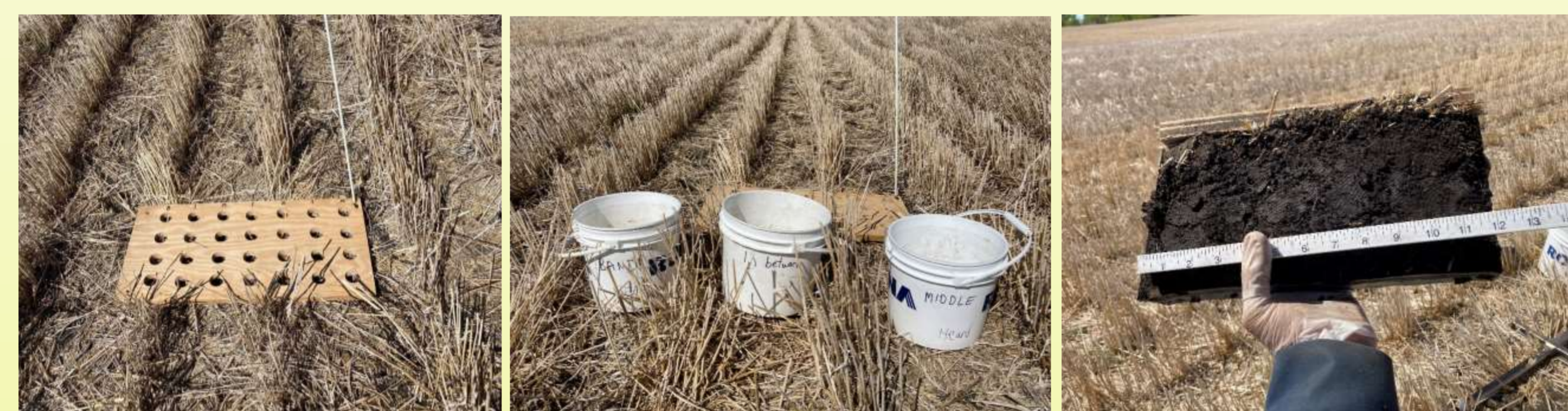
Figures 7-9. Soil sampling template (left), 3 pails (middle) and cross-section sample (right).