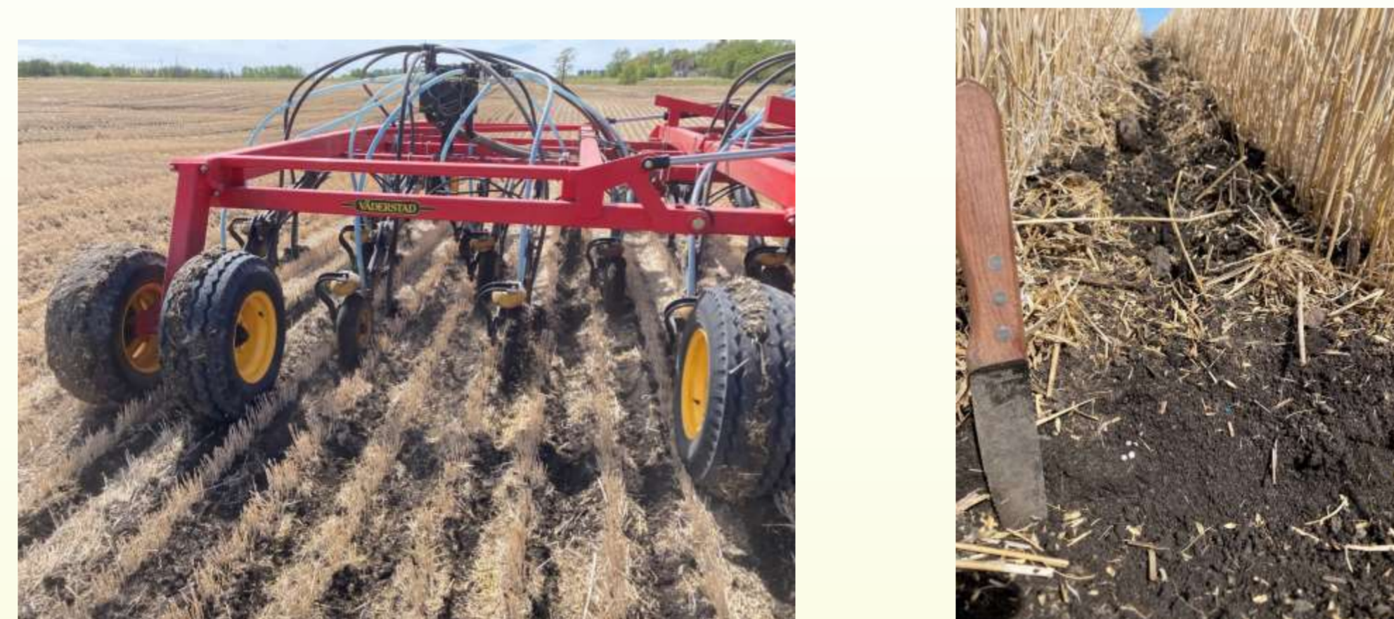
Figures 5,6. Seeding and sideband fertilization (left). Note fertilizer placement to the side and below the canola seed (right).