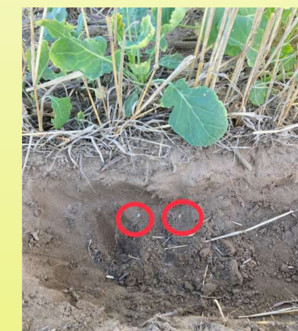
Figure 12. Spring applied fertilizer granules in fall 2021 when soil sampling