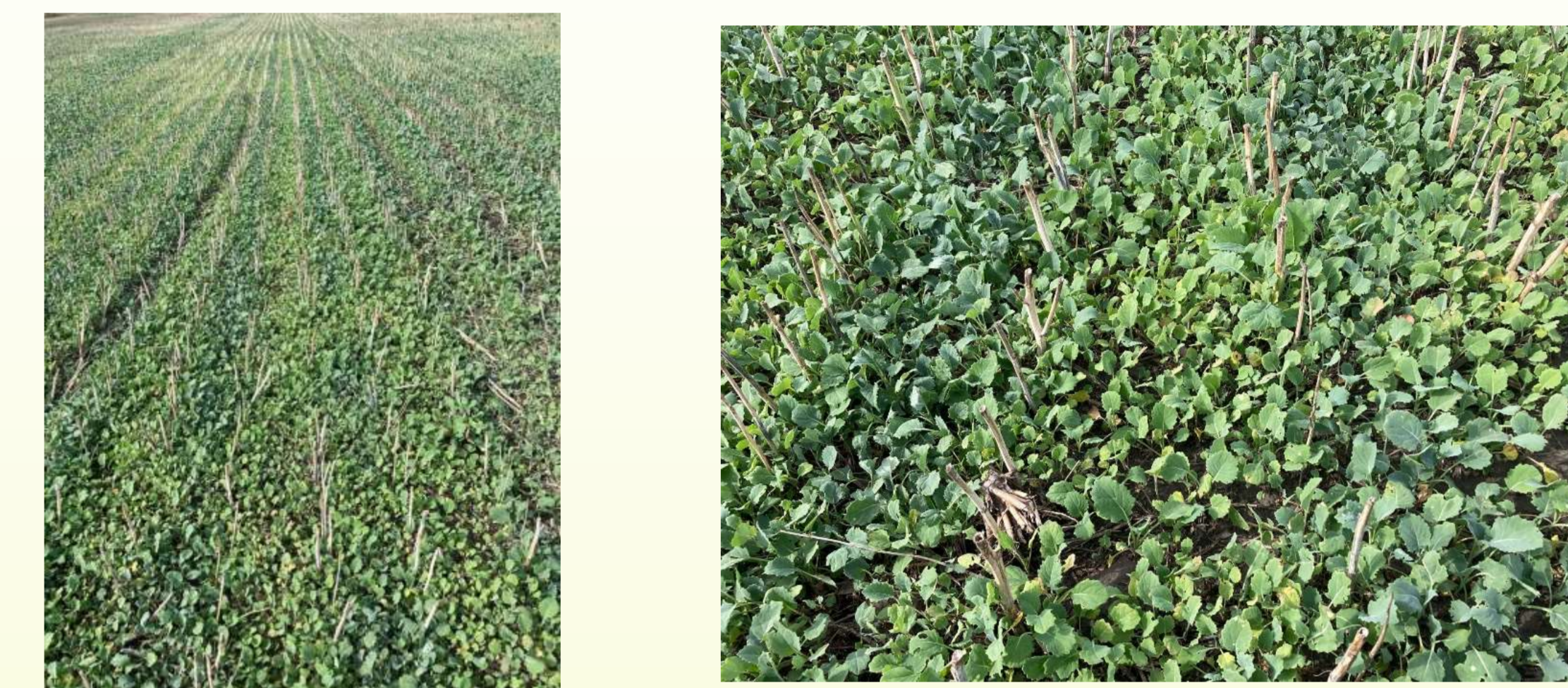
Figures 10-11. Greener, more vigorous volunteer canola growing over spring placed fertilizer in MRB.