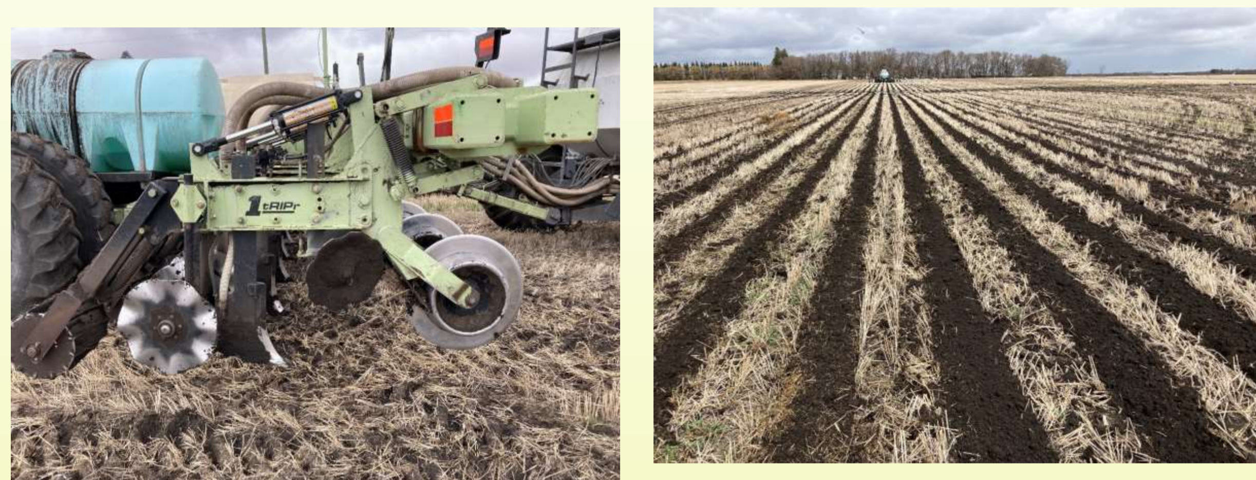
Figure 1-2. Strip till application of nutrients prior to seeding in 10" wide bands on 30" row spacing.